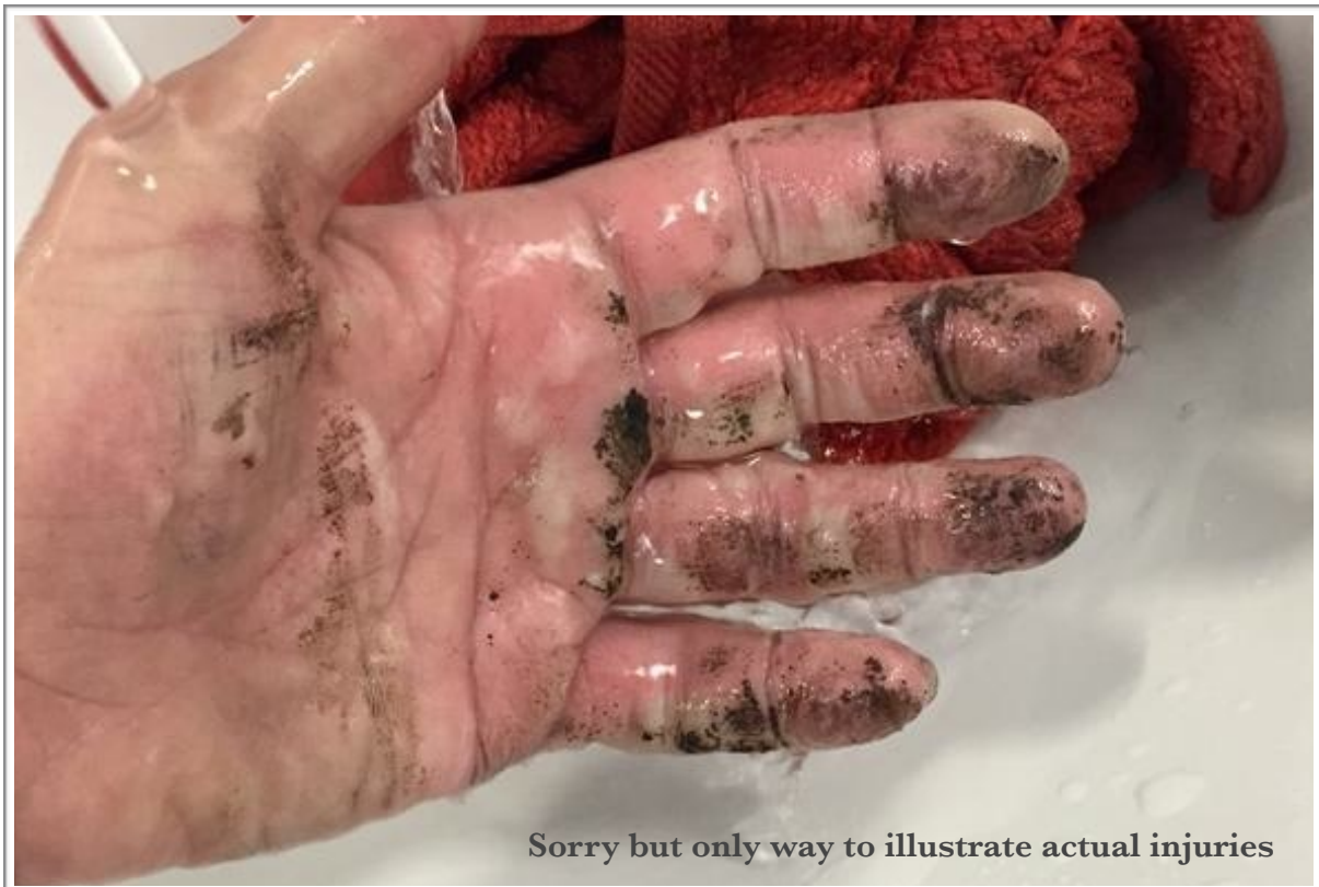
Sorry but only way to illustrate actual injuries

“What everyone ought to know about buying/selling Power Banks (portable phone chargers), safely , but probably don't know to ask.”